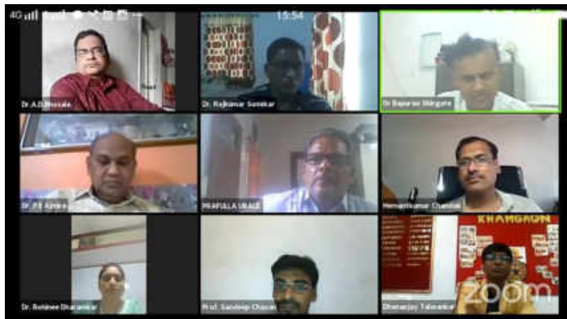
Screenshot 1: Faculties attending the workshop