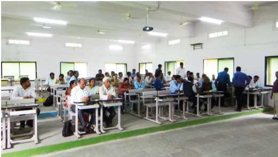
Principals and IQAC coordinators signing MoU