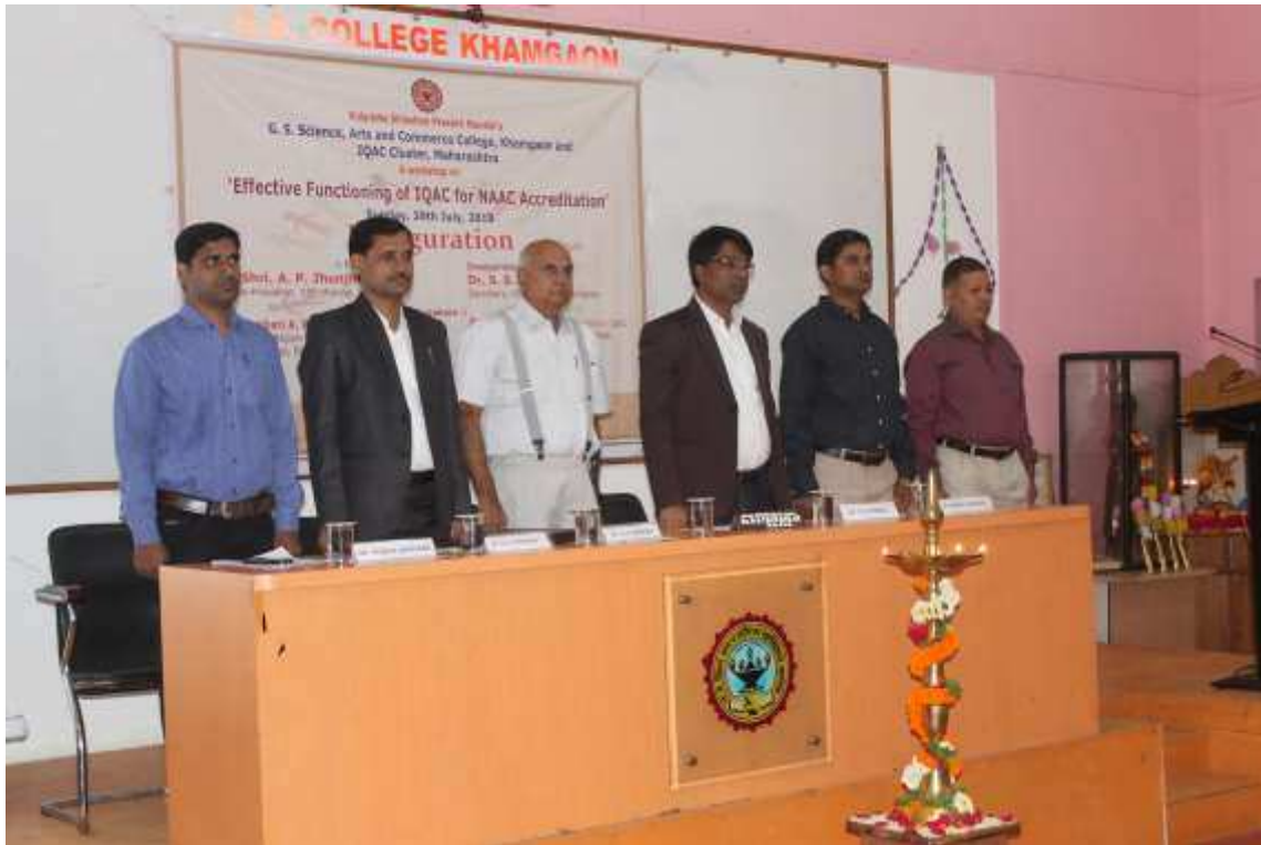
All dignitaries during the university song

Finally, the session ended with a group photo of all participants and the speakers.