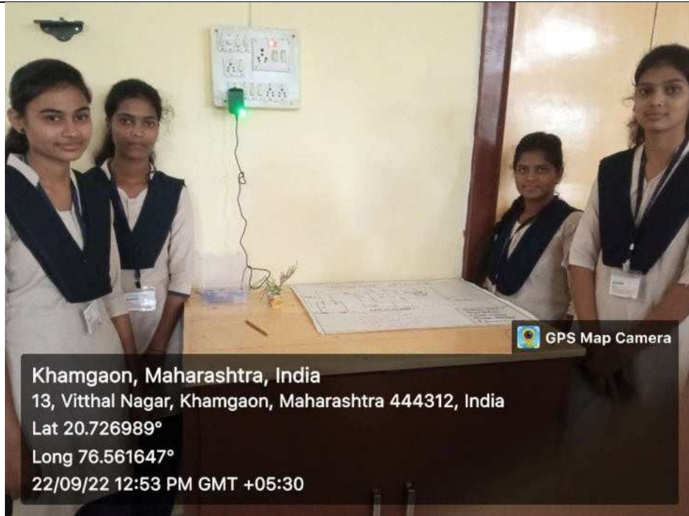
Participants Students with their projects