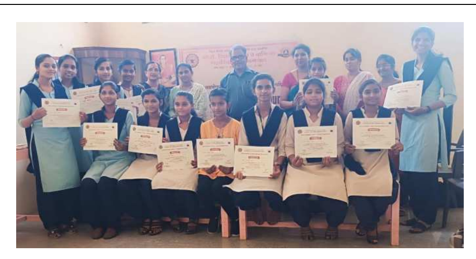
Students with course completion certificate