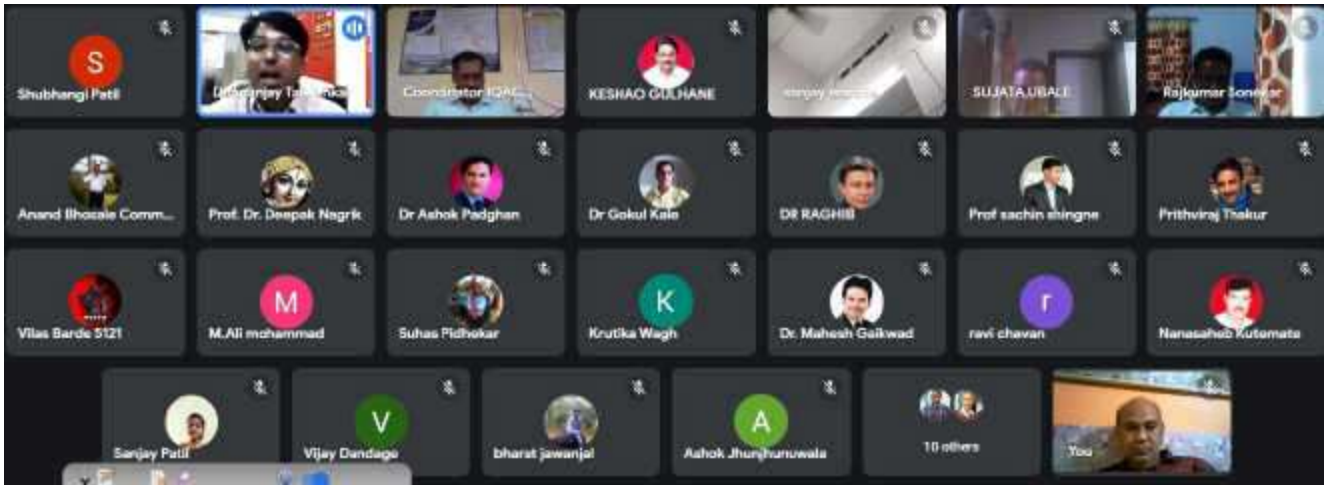
Screenshot 1: Principal Talwankar setting the tone for the workshop

Some of the screenshot of the event are: