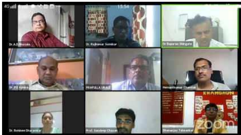
Screenshot 1: Faculties attending the workshop