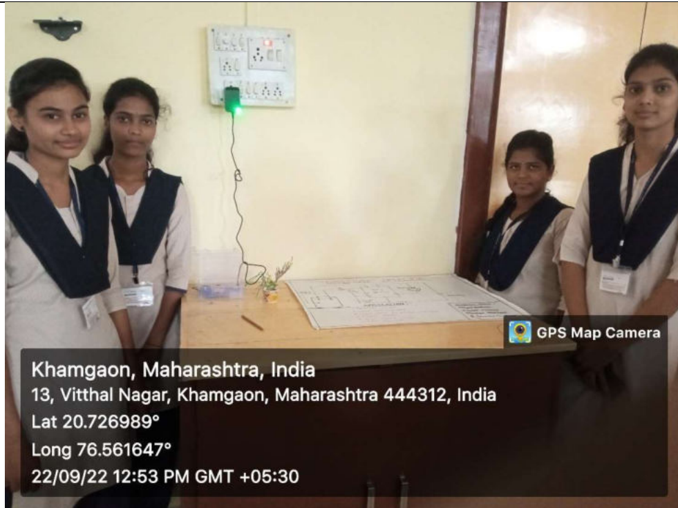
Participants Students with their projects